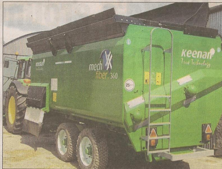
■ LEFT: The new iKeenan mixer wagon – the world's first truly intelligent diet feeder.

It allows the farmer or his nutritionist to make ration changes remotely, to review the rations that have been fed